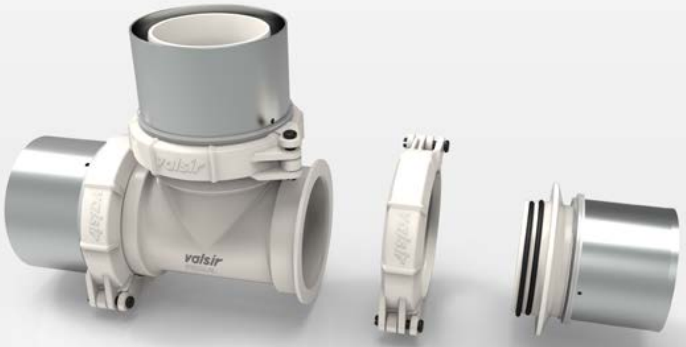
Examples Pexal® XL parts combined